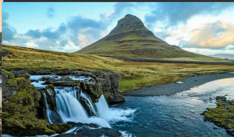
SALON HM | FABBRI GIOVANNI, Italy, Kirkjufell- Iceland 074-21