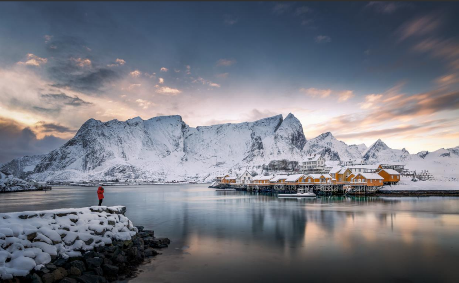
SALON DIPLOMA 3rd | IRMGARD CRISPIN, Germany, the person in the red jacket