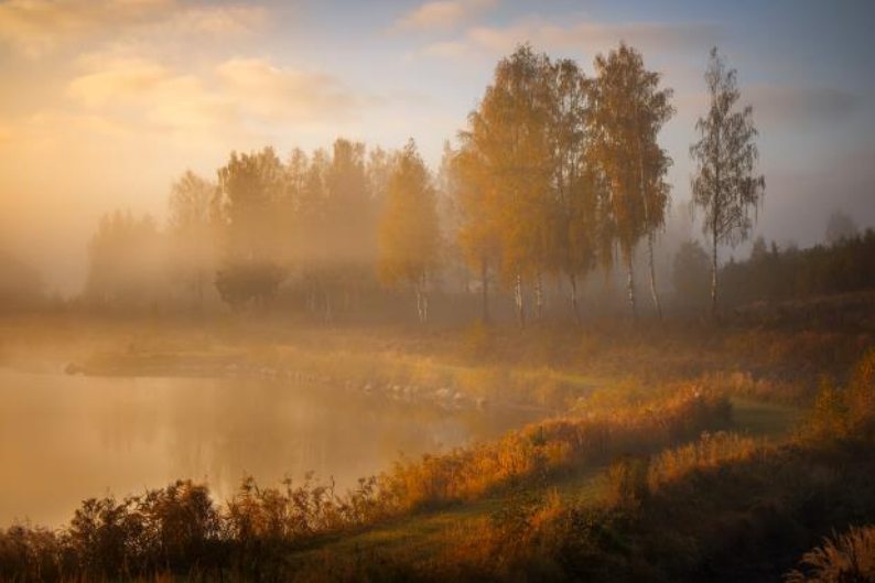
PCP HM | IVANOVA INGA, Latvia, Autumn landscape in Latgale