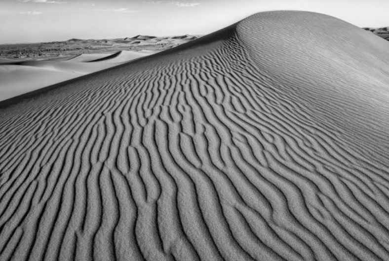
SALON HM | JOHN CLARE, England, Wind patterns