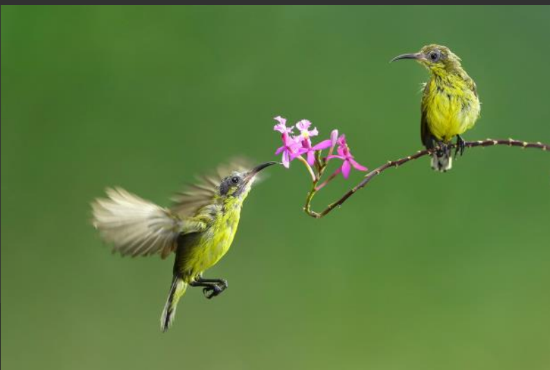
SALON HM | KYRA MODESTY, Indonesia, The Two Birds