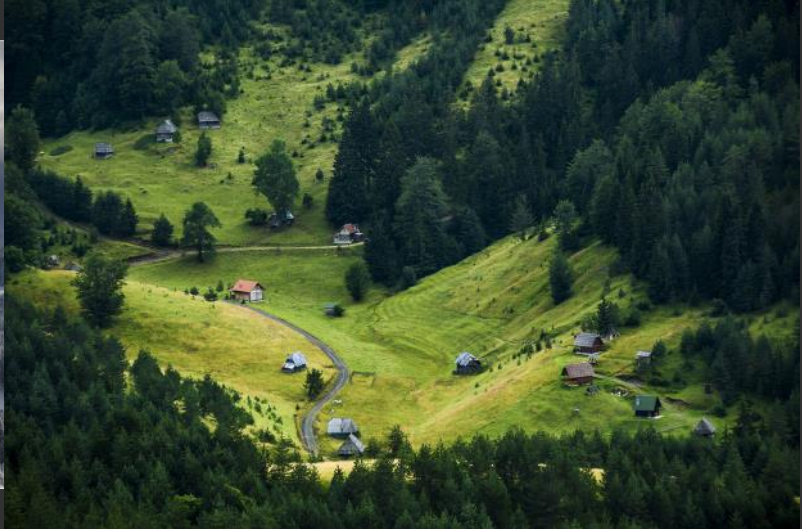
SALON HM | BOROJEVIC NENAD, Serbia, Village