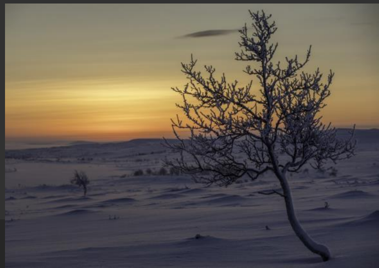
KPA HM | ILKKA HAKULINEN, Finland, Noon of Polar night