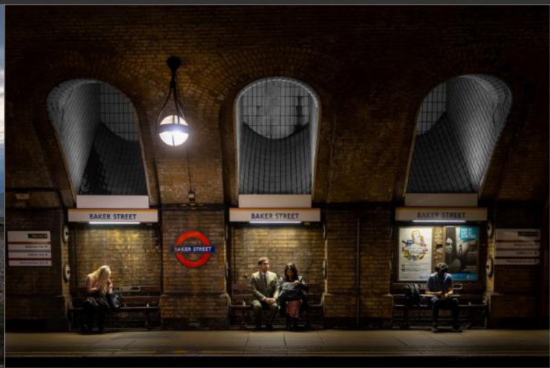
SALON HM | OWEN EDMONDS, Wales, Baker Street