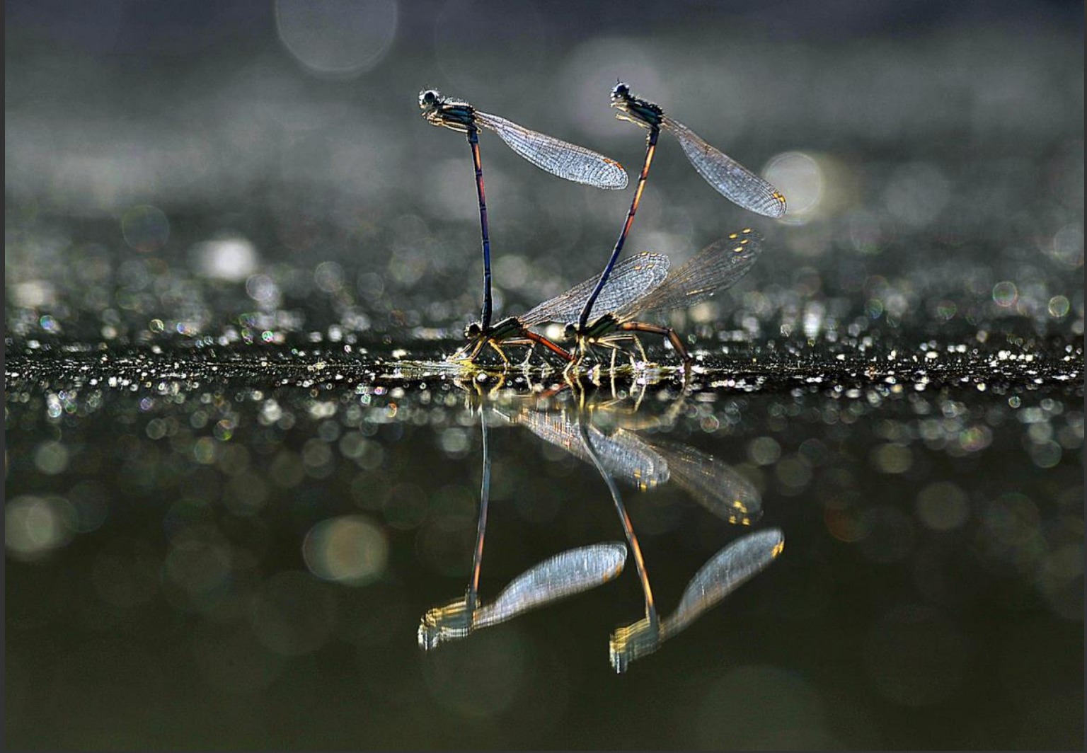
SALON DIPLOMA 1st | ISTVAN KEREKES, Hungary, Dragonflies lake