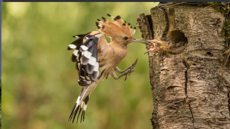
KPA HM | FABBRI GIOVANNI, Italy, Hoopoe-beackful of food 386-21