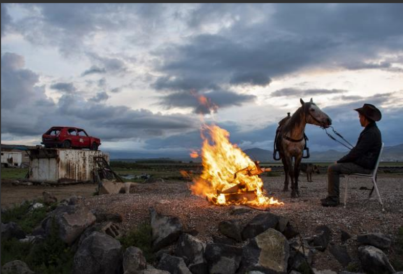
SALON HM | YAKAL CEM, Turkey, horses_of_uncle_ali