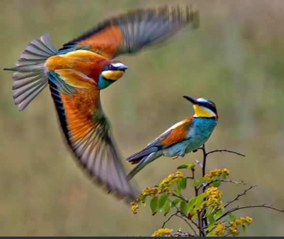
PCP HM | BIROL KARAIBIS, Turkey, my love