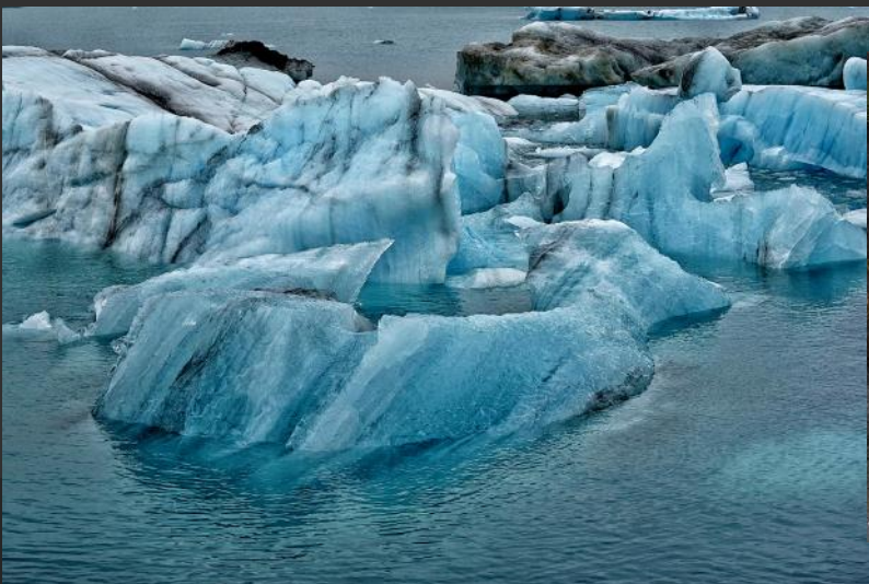
KPA HM | VALENTINA STAN, Romania, A Bit of Lagoon