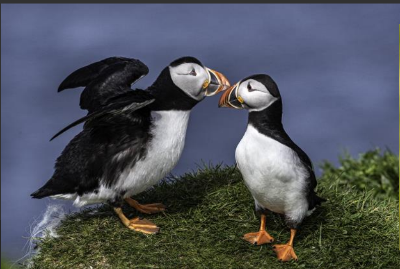
KPA HM | MARZIO VIZZONI, Italy, PUFFINS