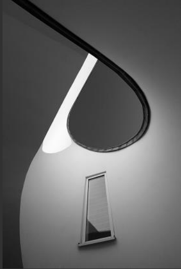
SALON HM | ELISABETH AEMMER, Switzerland, Vitra