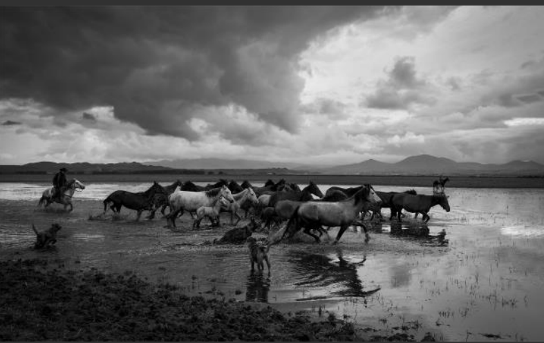
SALON HM | YAKAL CEM, Turkey, hormetci village and horses