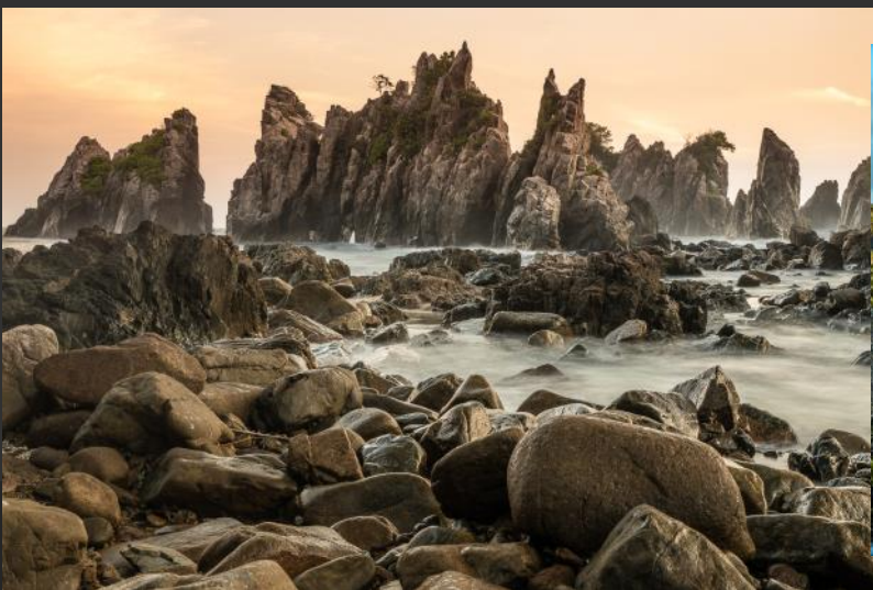
SALON HM | HARDIONO PUSPONEGORO, Indonesia, Shark tooth in the morning