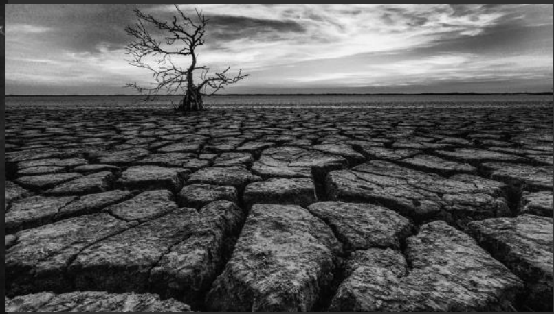
PCP HM | HO WEI-CHIN, Taiwan, Dry land