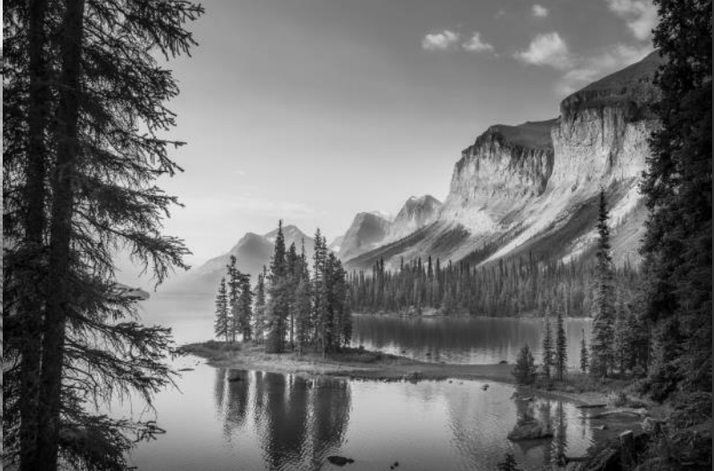
SALON HM | SVENDSEN FRITS, Denmark, Canada 1