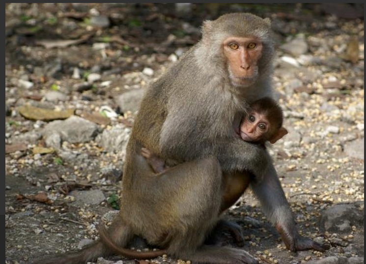
PCP HM | BENARD DECAUDIN, France, Protection intime