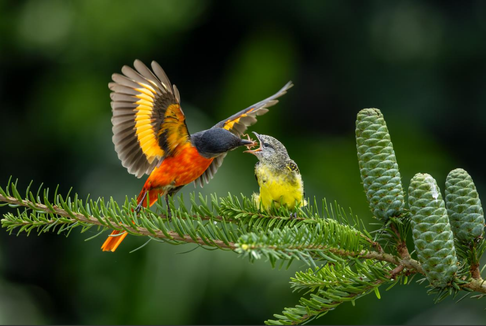
PCP DIPLOMA 2nd | CHIU JUI SHANG, Taiwan, Suspended Nourishment