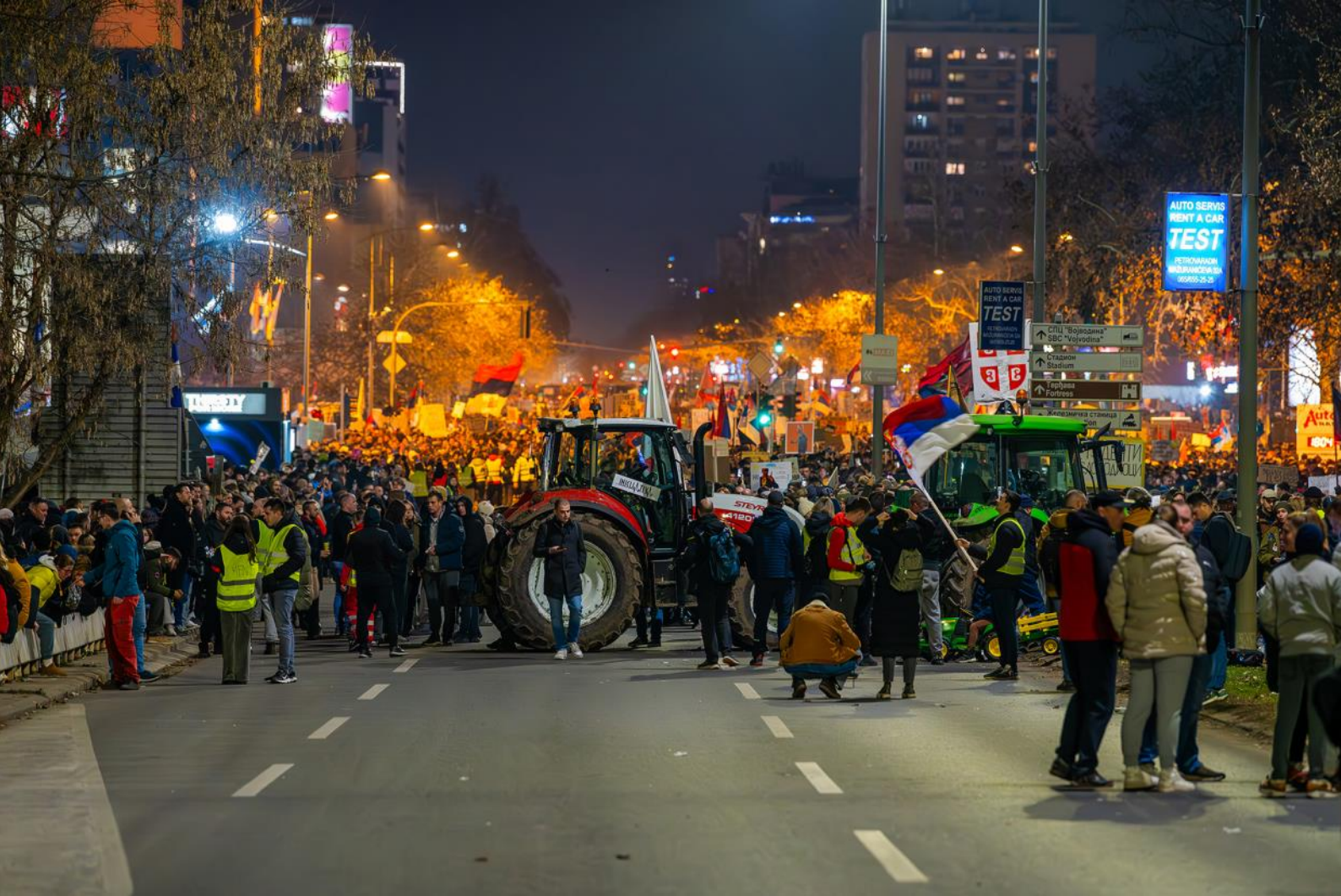
KPA DIPLOMA 3rd | SRDJAN ALEKSIC, Serbia, Blockade