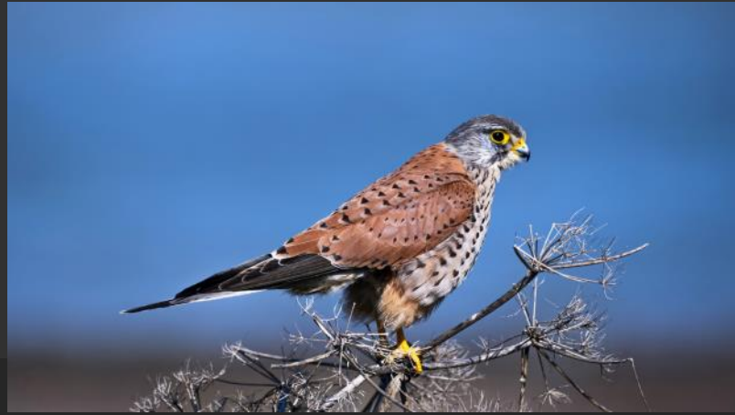
KPA HM | GEORGE YIALLOURIS, Cyprus, SALT LAKE PETRITIS 02