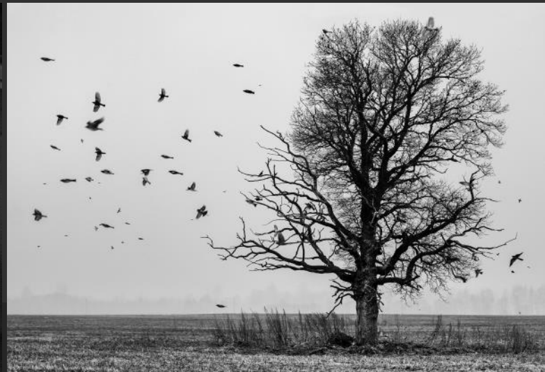
KPA HM | IVANOVA INGA, Latvia, Refugees