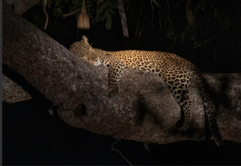
SALON HM | IRMGARD CRISPIN, Germany, sleeping leopard