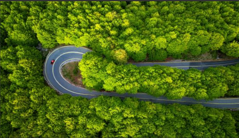
PCP HM | GEORGE YIALLOURIS, Cyprus, THE RED DOT