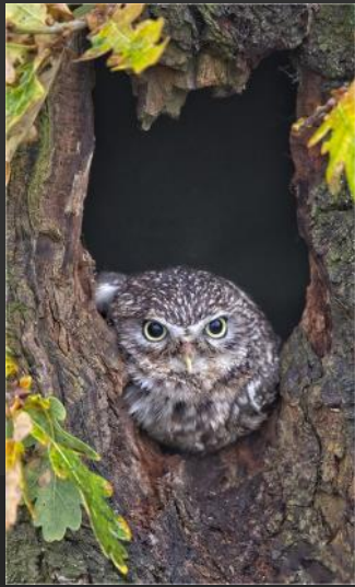
PCP HM | GRAHAM LLOYD, England, Little Owl in Nest Hole