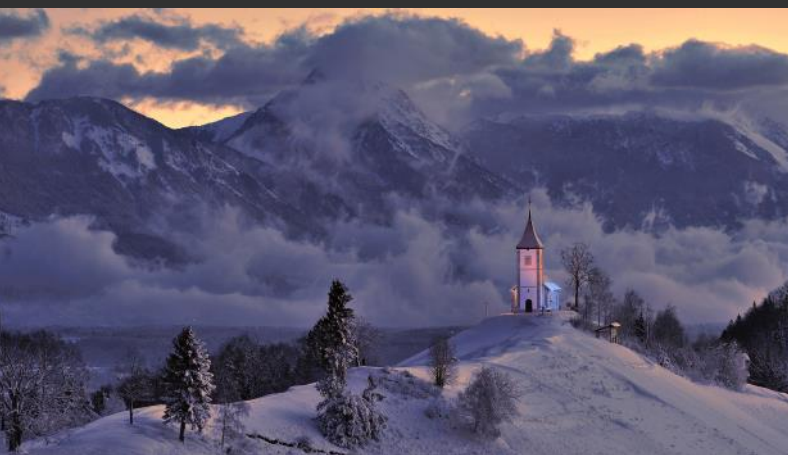
SALON HM | JANEZ PODNAR, Slovenia, Leave of Night