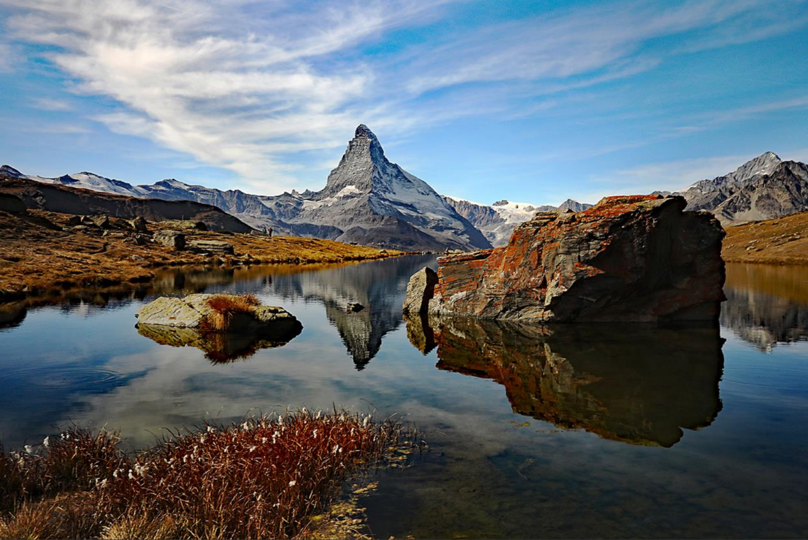
PCP DIPLOMA 3rd | ELISABETH AEMMER, Switzerland, Am Stellisee