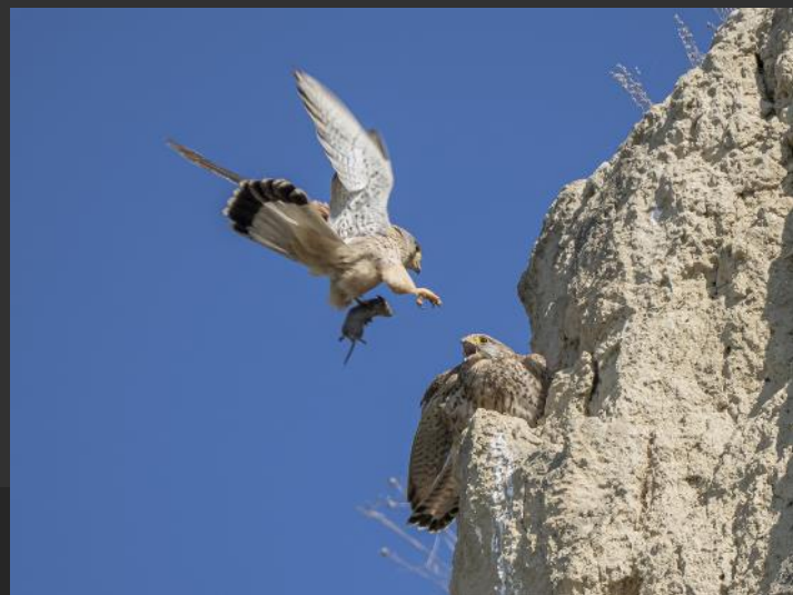
SALON HM | SKLOPIC DEJAN, Serbia, Vetruska