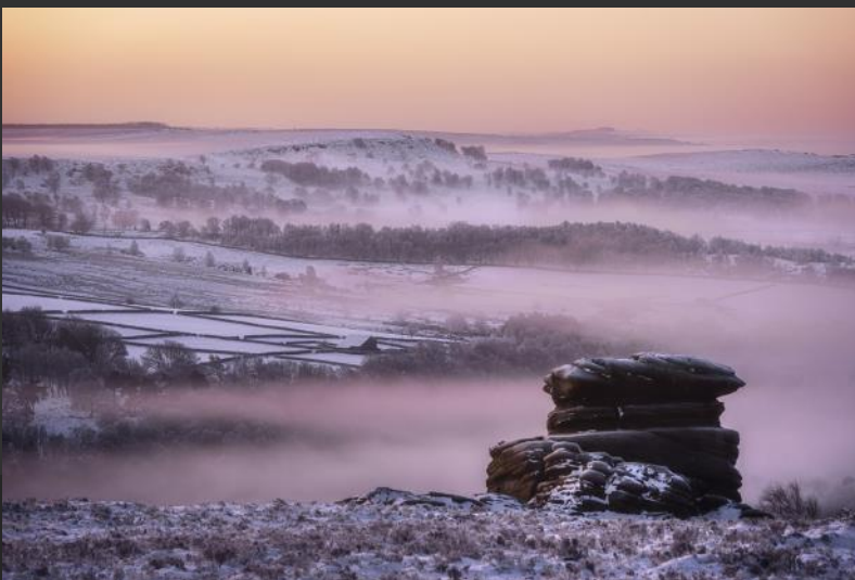
PCP HM | HARRISON PAUL, England, Misty Morning