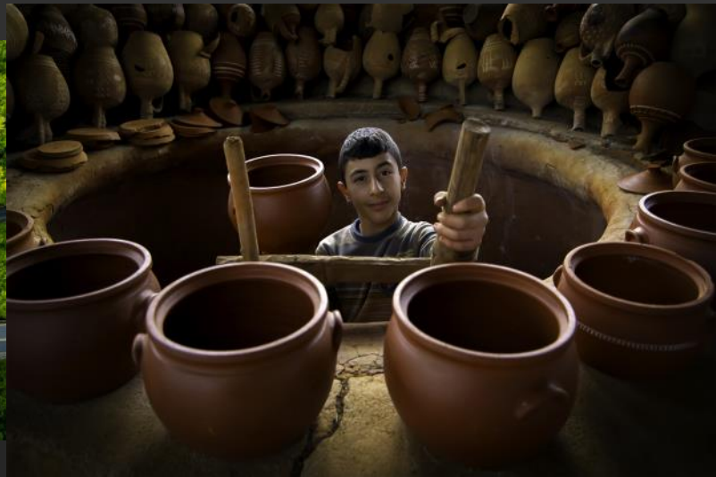
PCP HM | YAKAL CEM, Turkey, hand_made_potter