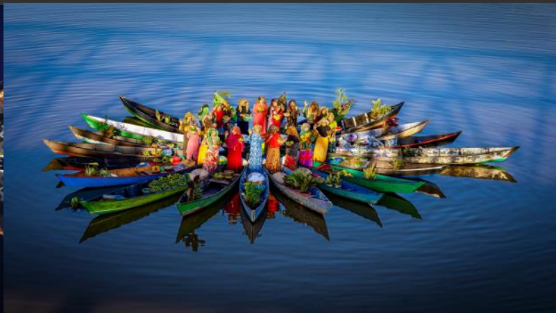
KPA HM | CHIU JUI SHANG, Taiwan, Floating Wreath