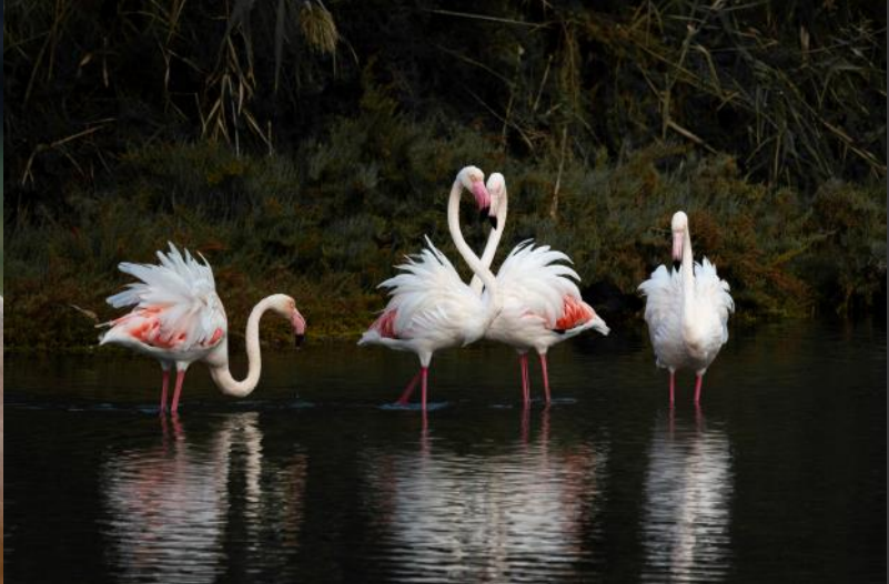
KPA HM | IVANOVA INGA, Latvia, Sicilian lovers