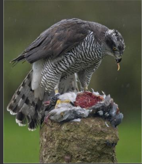
PCP HM | GRAHAM LLOYD, England, Goshawk Feeding