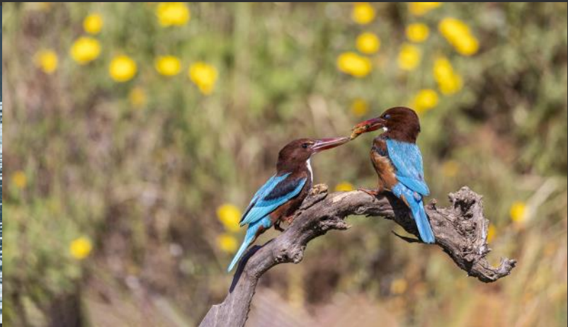
SALON HM | ZOHAR ITZHAK, Israel, Open your mouth wide