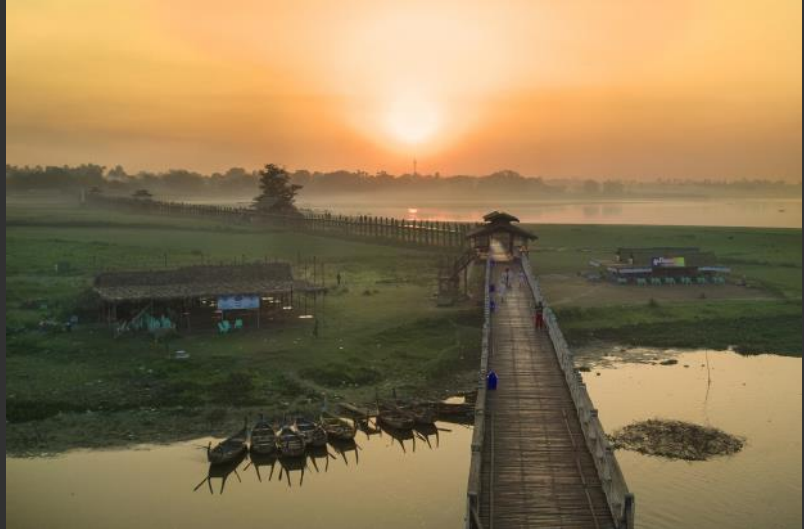
KPA HM | KYRA MODESTY, Indonesia, One Fine Morning at U Bein Bridge