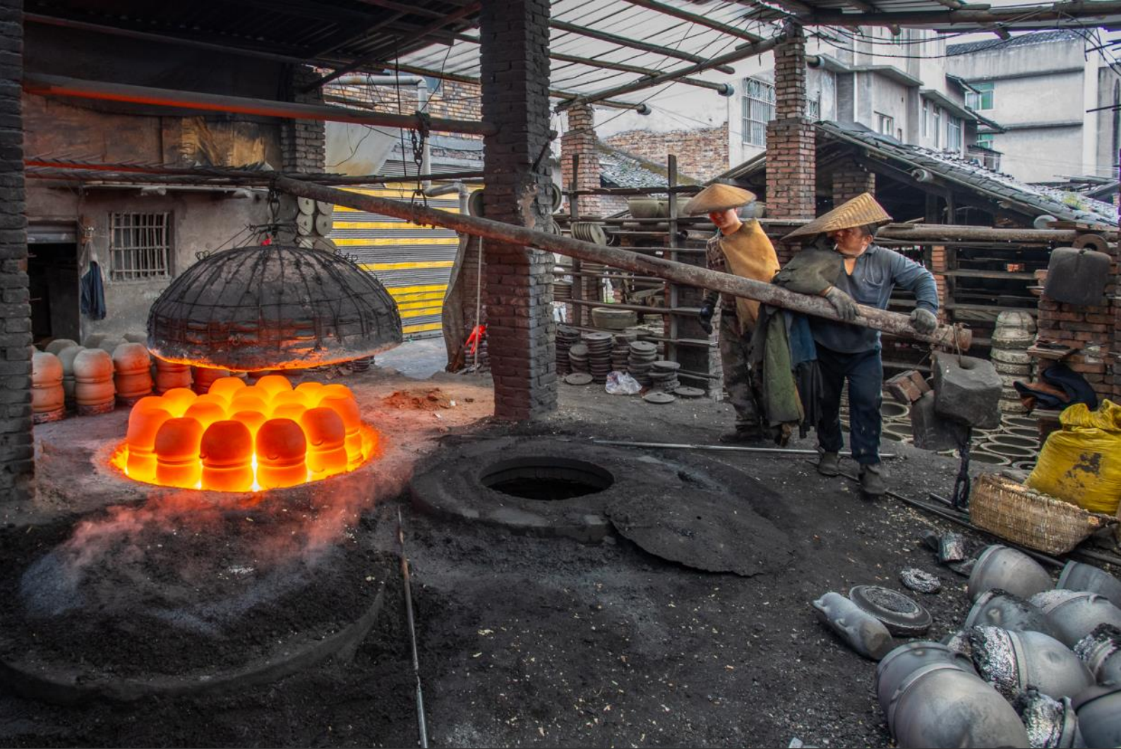
SALON DIPLOMA 2nd | FRANCIS KING, Canada, Opening The Kiln 102