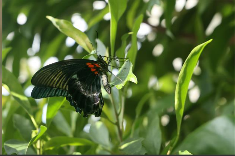
PCP HM | UYSAL HATICE, Turkey, zehirli kelebek