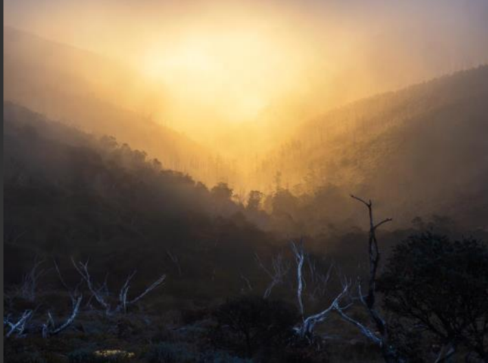
KPA HM | MCTAGGART GAIL, Australia, Golden light