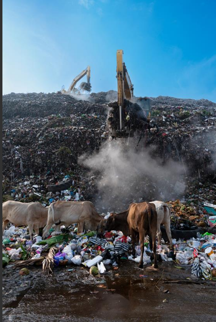
KPA DIPLOMA 1st | KYRA MODESTY, Indonesia, In the Dirt