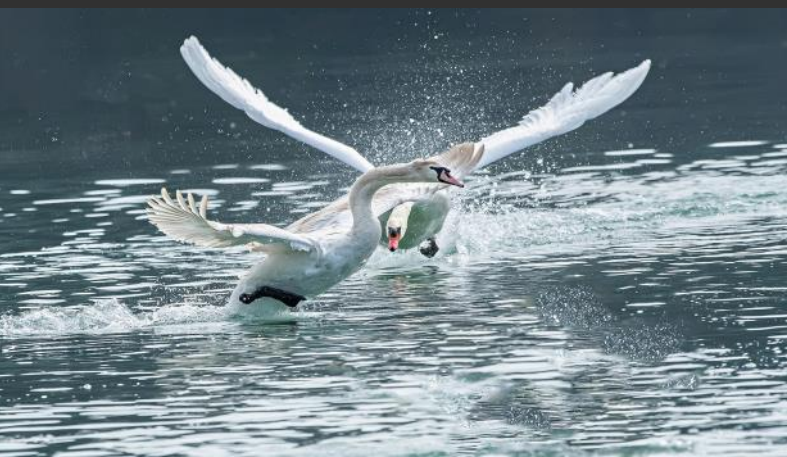
SALON HM | JANEZ PODNAR, Slovenia, Sharp_Conflict