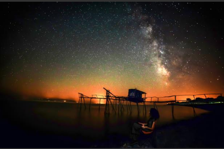
KPA HM | CEVIK MEHMET, Turkey, milkyway