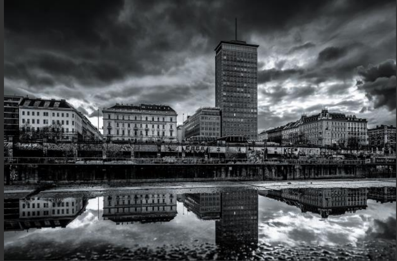
SALON HM | CHRISTIAN WERNER, Austria, Thunderstorm mood_WE625_00728sw