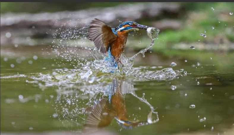
SALON HM | FABBRI GIOVANNI, Italy, Kingfisher with fish 018-22