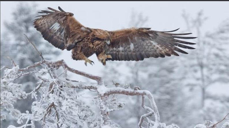
PCP HM | ILKKA HAKULINEN, Finland, Eagle_is_landing