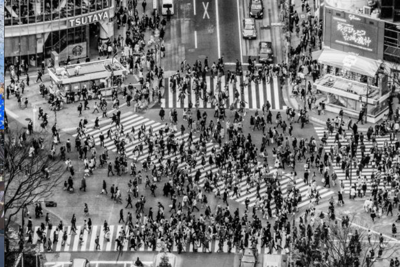
PCP HM | PERTTI YLINEN, Finland, Crowded Crosswalks