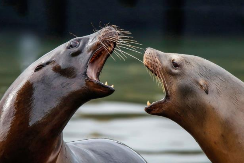
KPA HM | RYU SHIN WOO, South Korea, Tension2