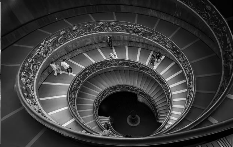
SALON HM | ABDULLAH VURAL, Turkey, stairs