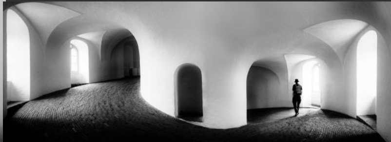
SALON HM | IRMGARD CRISPIN, Germany, round tower