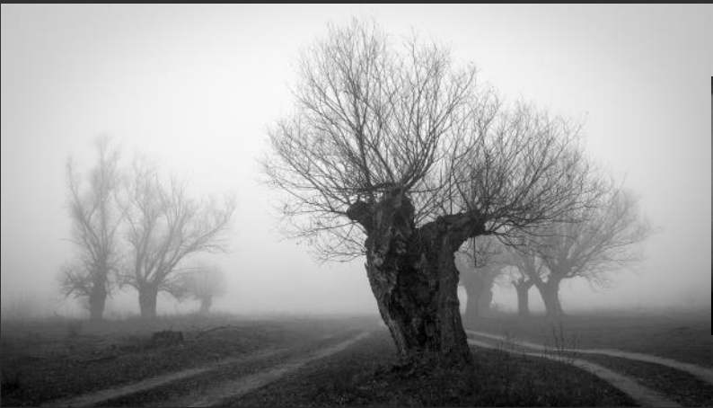
SALON HM | SKLOPIC DEJAN, Serbia, Belegis